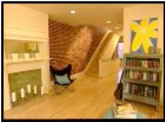
After, second floor library