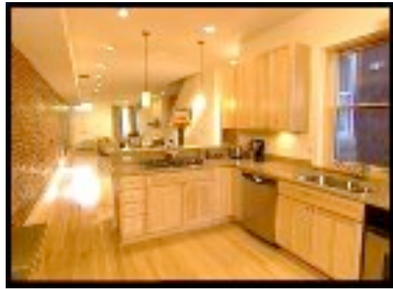
After, first floor kitchen and living area